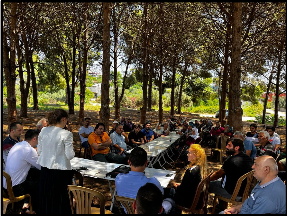
Photos of Stakeholder Engagement